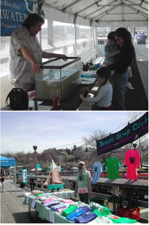
Earth Day

Earth Day Festival, Sunday April 20th, at the waterfront